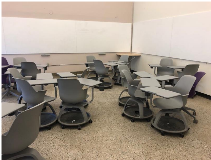
Image Description: View of the classroom from the instructor's podium. There are multiple chairs with desks attached for students, that can be arranged according to the instructor's preference. Whiteboards are located on the left wall and the front wall. This classroom is accessible for instructors.

Image Description: Image of the wall podium at the front of the classroom. This podium is not movable or height adjustable. This podium is accessible.