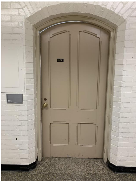
Image Description: The door to Theological Hall room 209 is beige and has a doorknob on the right side of the door.

Image Description: View of the classroom from a student seat near the rear of the room. In front are multiple rows of empty chairs. The instructor podium is at the front of the room on the right. A digital projector on the ceiling, projects onto a screen that extends from the ceiling. This classroom is accessible for students.