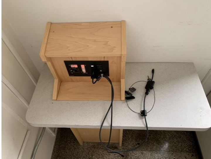
Image Description: Image of the wall podium at the front of the classroom. This podium is not movable or height adjustable. This podium is accessible.