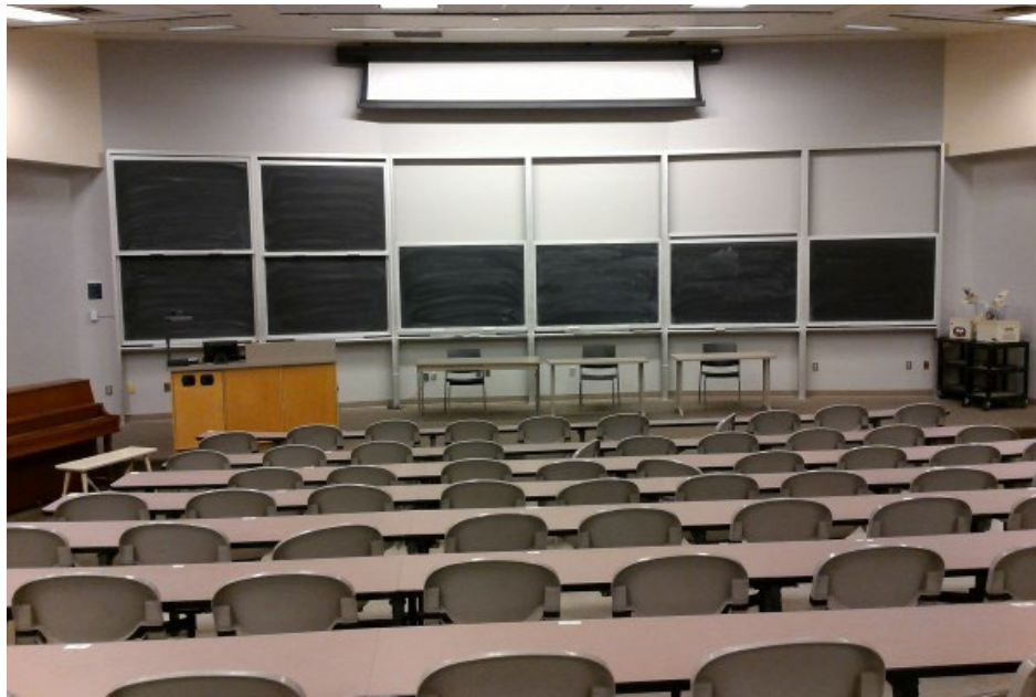
Image Description: View of the classroom from a student seat near the rear of the room. In front are multiple rows of empty tables and chairs. The instructor podium is at the front of the room on the left. A digital projector on the ceiling, projects onto a screen that extends from the ceiling. This classroom is accessible for students.

Image Description: View of the classroom from the instructor's podium. There are 10 rows of long tables with swivel chairs for students, facing the front of the room. The entryway door is located at the back of the classroom, on the right. This classroom is accessible for instructors.