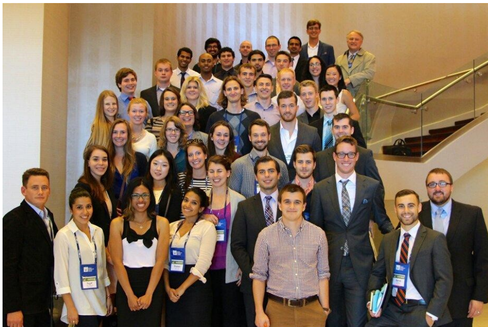
SURP students at the 2014 OPPI Symposium in Niagara Falls.