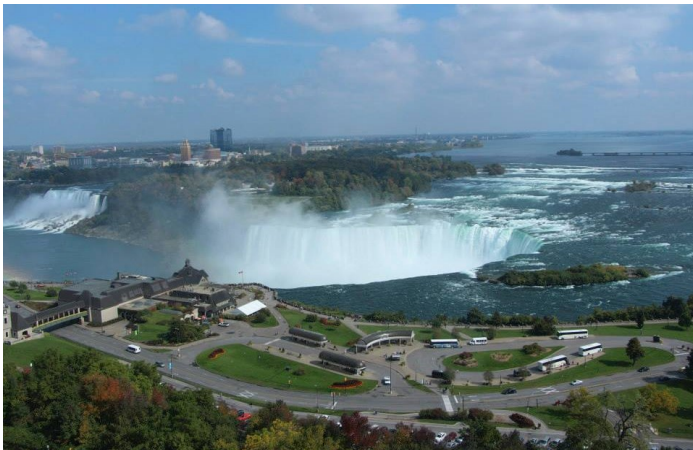
View of Niagara Falls.