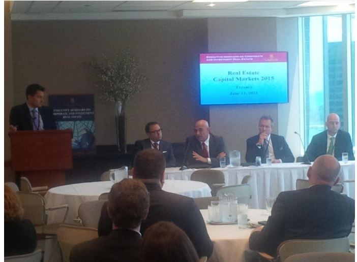
The 2015 Real Estate Capital Markets executive seminar in Toronto.

The Q25 now encompasses Queen's University's Executive Seminars on Corporate and Investment Real Estate (ESCIRE), founded in 2004 and well-respected as a provider of high-quality, small and interactive executive development events to the commercial real estate sector. In 2014-15, Q25/ESCIRE hosted three executive seminars in Toronto, all of which were successful, fully-subscribed events: Optimizing Value in Investment Real Estate: Office, Industrial, Retail & Multi-Unit Residential (November 2014); Investing in Accommodation Real Estate: Condos, Hotels, Life Cycle Housing & Human Capital (March 2015); and Real Estate Capital Markets 2015 (June 2015).