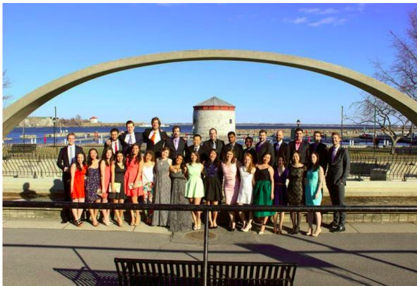
SURP Class of 2015.

and I have the utmost confidence that each and every one of them will excel in whatever path they follow. As the class of 2015 departs, we begin to plan for the class of 2017. And with that we look forward to the next year of learning and professional experience.