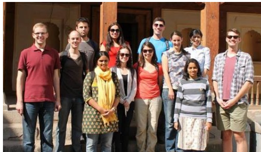
The SURP international project course team with its client in Pune, India.