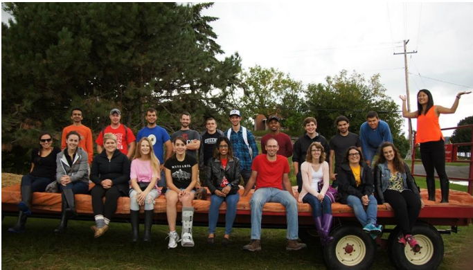
SURPers going to a corn maze during Orientation Week 2014.

As the 2014-2015 academic year came to a close, the SURP student community was proud to bid farewell to the graduating class of 2015. This year the QGAPS executive continued the blossoming tradition of fostering successful learning by creating a healthy social environment and continually assisting with professional development opportunities. On behalf of QGAPS and the student body I would like to thank our exceptional faculty and staff for another successful academic year.