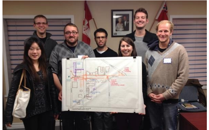
SURP students celebrating World Town Planning Day at an outreach event for younger students in Norwood, Ontario.

presentation of a TOD Implementation strategy at Ottawa City Hall.