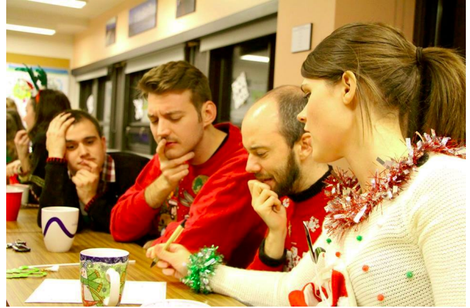
SURP students at the 2014 Holiday Trivia Party.

QGAPS had a busy year hosting a number of different events for students both socially and professionally. The social committee has championed a number of events for students to de-stress including the annual formal, a movie night and hockey games. There have also been opportunities