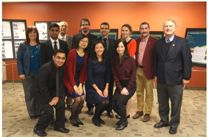
SURP 824: Land Use and Real Estate Project Course team: