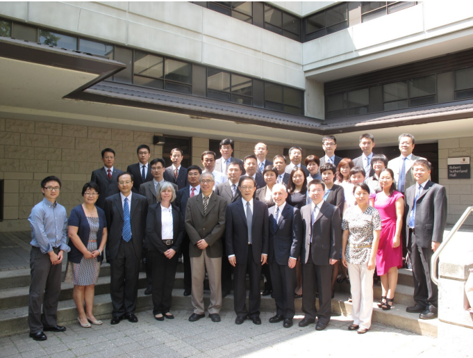
The Queen's-China Ministry of Land and Resources delegation outside Robert Sutherland Hall.

The Queen's-China Ministry of Land and Resources (MLR) internship program was established 20 years ago under a Memorandum of Understanding between the University and the Ministry. The purpose is to enhance the effectiveness and efficiency of land and mineral resources administration and management in China by sharing relevant Canadian experiences with Chinese professionals/officials. Every year, six to eight interns are placed in Canada for five months, in government agencies, private firms and non-governmental organizations to observe and study Canadian practices as well as participate in, and contribute to Canadian projects. Government sponsors over the years have included Natural Resources Canada, Ontario Ministry of Northern Development and Mines, Ministry of Natural Resources, Ministry of Municipal Affairs and Housing, Municipality of Kingston, and Municipality of Hastings. Building on past successes, MLR started the process of a new MOU with expanded activities and financial support. The most exciting development was research collaboration between Queen's and MLR.