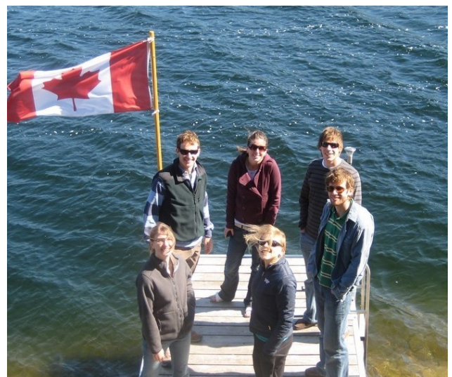
Students of the 2008 SURP-825 Environmental Services Project Course, posing at Desert Lake.