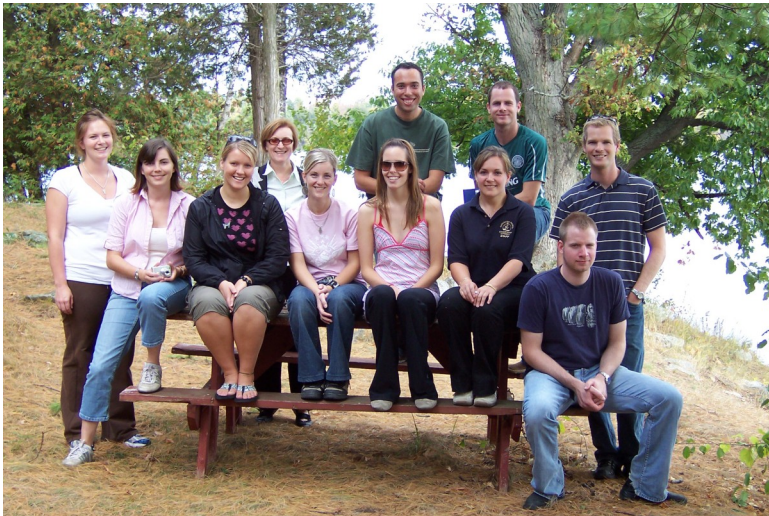
Students from the 2007 SURP-825 Environmental Services Project Course.

Development Options", which contains over 100 pages, a large number of land use maps, images and a CD-ROM. This was the first time the Ottawa Airport Authority was involved as a client for the land use project course.