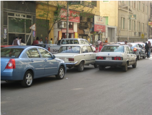
Above: With parking spaces in high demand, cars are left in neutral and pushed out of the way by hand. Cars are typically double parked, but in some cases three or four lanes are used as parking on each side of the street.

best. Despite living, working, and shopping far from these troubled areas of Cairo, the affluent elite are not immune to the problems facing the city. A visit to CityStars, one of the Middle East's largest and most successful high-end mall complexes, required sitting in gridlock for nearly an hour before undergoing an intense security screening process which makes the international airport appear lax. The affluent may be able to achieve physical separation by living in private enclaves, but economically and socially, these groups are just as much dependent on the orderly functioning and general welfare of the city as the remainder of Cairo's population.