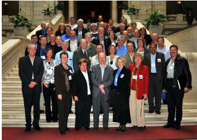
Attendees of the 2008 NEFPP Conference posing on the steps of the Manitoba Legislature.

Please see www.publicpropertyforum.ca for more information about the Forum.