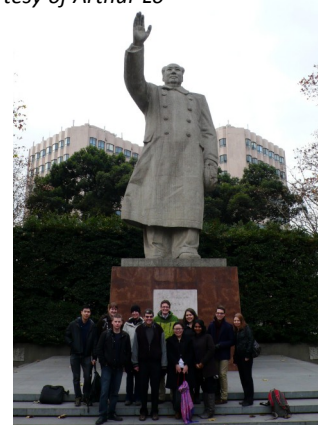
December 15, 2011—SURP project team in front of a statue of Chairman Mao Zedong on the campus of Shanghai's Tongji University