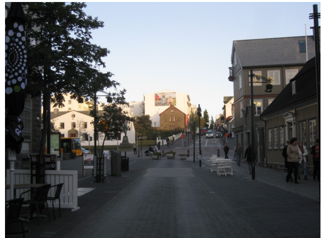
Streetscape in downtown Reykjavik. Planters at the end of the street can be moved for snow clearing and other activities.

These design elements help residents and visitors in Reykjavik enjoy the city throughout the colder months. A large portion of Canada has a northern climate, and lessons learned in Reykjavik can be transferable to northern communities in our country. The winter months have a lot to offer, and their advantages and opportunities can be enhanced through careful design and planning.