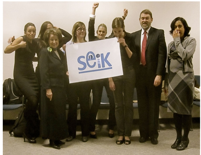
SURP-823 Housing and Human Services Project Course Team Fall 2011