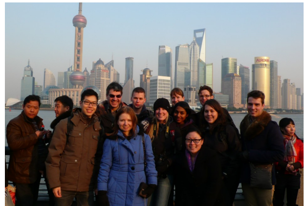
December 10, 2011—SURP project team and passersby in front of Shanghai's skyline

environmental planning. Although Shanghai officials are very receptive to Western planning principles, students recommended that officials draw upon foreign expertise and international best practices, where appropriate, but focus on the development of "home-grown" solutions to planning problems.