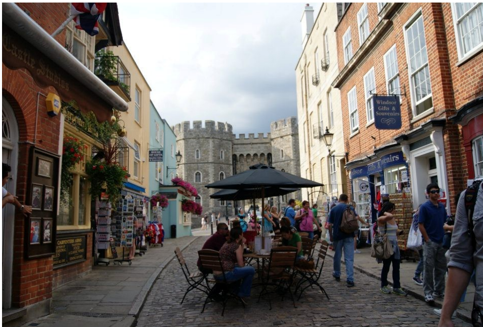
Windsor, England