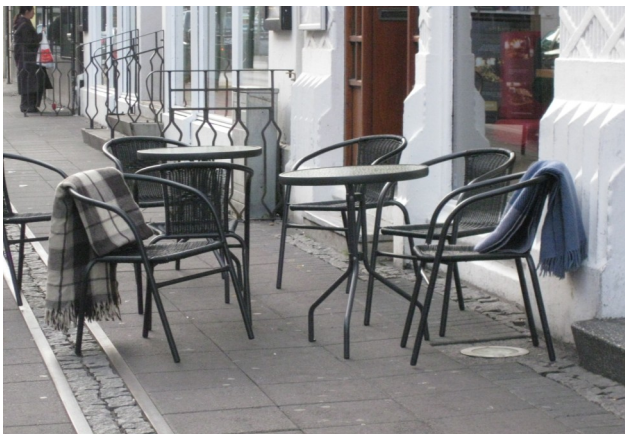
Outdoor seating in downtown Reykjavik, Iceland

Walking: Pedestrian walkways are emphasized both visually and texturally using different coloured materials and paving techniques. Public squares are generally flat to make snow clearing easier.