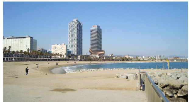
Barcelona—an urban waterfront

On the other hand, Cadiz, located near the Rock of Gibraltar in the south of Spain, has been an important port since ancient times. The city was founded by the Phoenicians around 1100 BC. Greek mythology used it as the setting for Hercules' tenth and final task. The city was the third most important in the Roman Empire at the time of Augustus. Many of Columbus' expeditions also set sail from here, and the city became the home of the Spanish treasure fleet. History is thus a very important tourist attraction for the city, and Cadiz has strived to maintain its maritime heritage. The original seawalls still run around the city, and its historic maritime fortifications have undergone extensive renovations. However, the city's waterfront is not simply frozen in time. The city has incorporated a modern port and has also built underground parking along and under the waterfront to alleviate congestion. Large sections of the waterfront are continuously being renovated without comprising the character of the city's heritage.