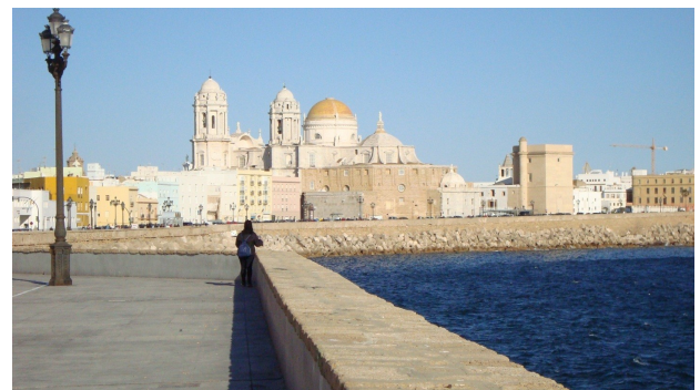
Cadiz—historic seawalls wrap around the city