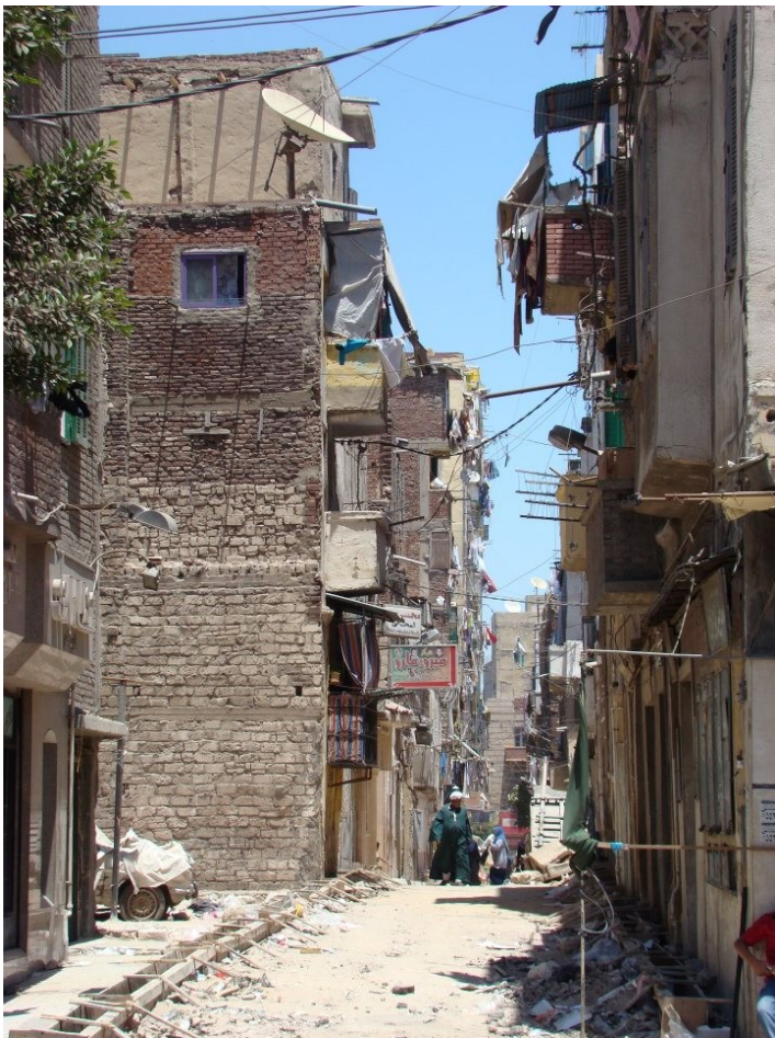
Alexandria, Egypt