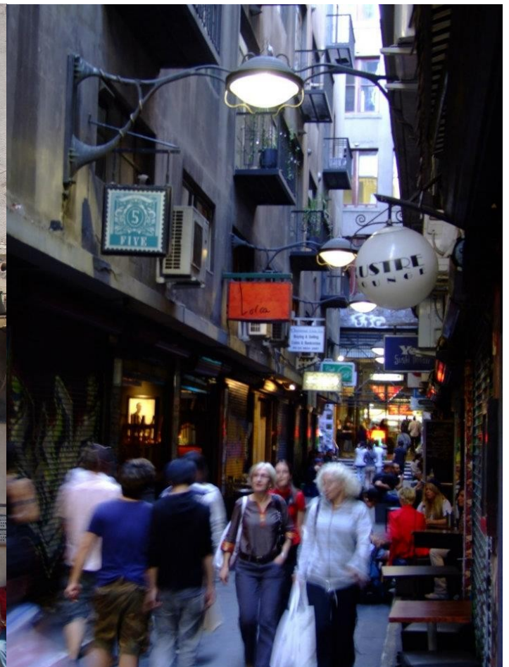
Centre Place in Melbourne, Australia