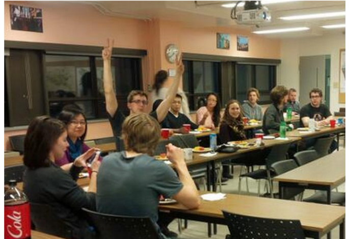
SURP students enjoying a movie night at the end of the Winter semester.

Quieting halls and empty offices are signs of another academic year finishing off at SURP. QGAPS had a busy year with an array of events and opportunities for students. Over the past several months the social committee made a solid effort to host events, allowing students to come out and de-stress. What better way to de-stress than having a movie night complete with an abundance of snacks. The best cure for a stressful semester: watching Wall-E of course. Along the way we put on our professional caps and found ourselves in Toronto for the annual Canadian Association of Planning Students conference. Our students had the opportunity to network with professional in the field, present their projects, and participate in discussions pertaining to planning issues and topics of interest.