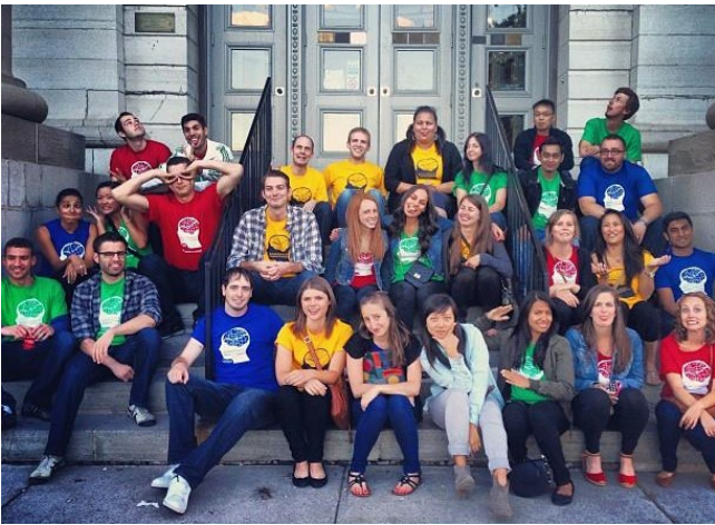
First-year students during Orientation Week 2013.

Another successful year has come and gone. For the past three years QGAPS has made a tremendous amount of effort in ensuring the student body's success both academically and professionally by fostering a strong SURP community. On behalf of the QGAPS, I would like to thank faculty, staff, and students for their on-going contributions and support to SURP. As always, we welcome any comments, questions, or recommendations you have for the betterment of QGAPS and the SURP experience.