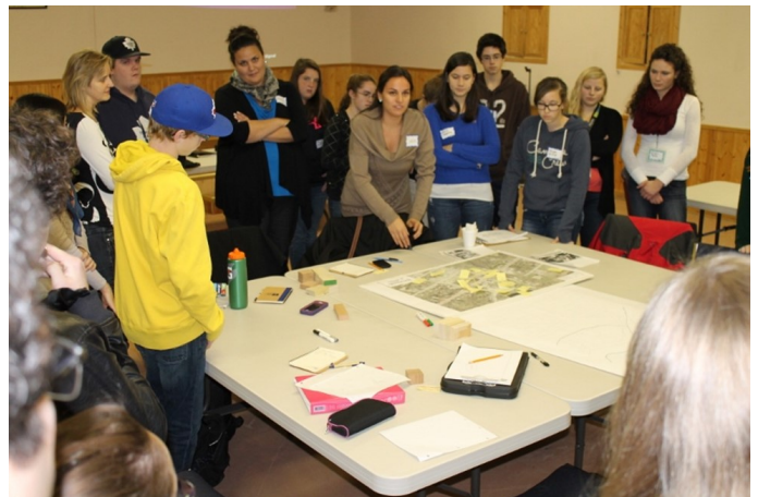
SURP students helping with the World Town Planning Day outreach event in Millbrook.