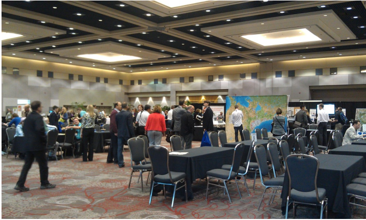
Conference attendees at the OPPI Conference in London.

how they impact healthy community planning. During the lunch break, there was a student/planner speed networking event that allowed student participants to make new connections. It was a great experience to have one-on-one conversations with professional planners.