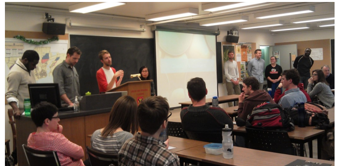
International Project Course team members sharing their experiences and findings of Auroville, India at SURP.

very successful. Both the client and the students have given very positive feedback to SURP. Please see page 21 for more information!