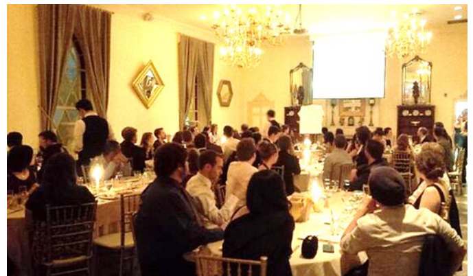
SURP community at the year-end Spring formal.

The time has come to say goodbye to our graduating class of 2014. We would like to wish them the best of luck in all of their future endeavours. As we say our goodbyes, we would also like to welcome the new SURPers who joined our community in September 2014. QGAPS looks forward to another year filled with memorable events and opportunities.