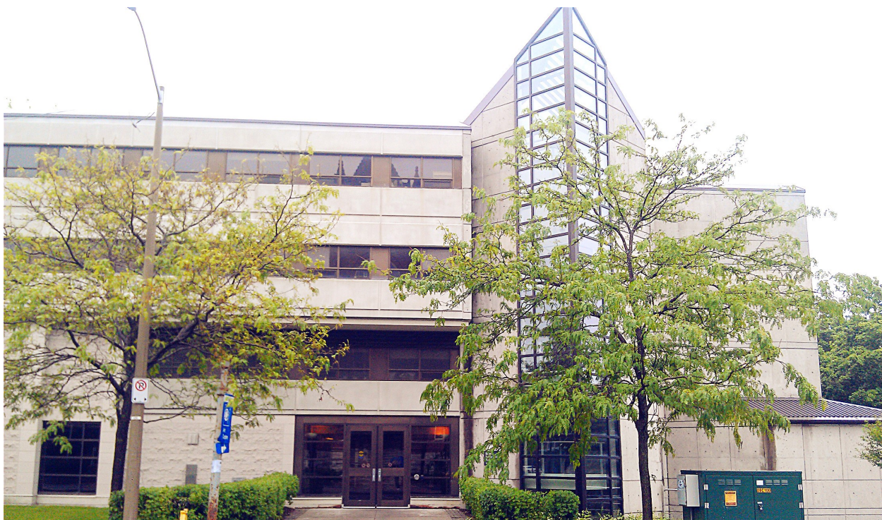
Home of the School of Urban and Regional Planning.

I am excited by the opportunity offered by these changes, both as SURP's Director and as a proud alumnus of the School. We will continue to seek input from SURP's faculty, staff, students, alumni and our many supporters in structuring a new future for urban and regional planning at Queen's University.