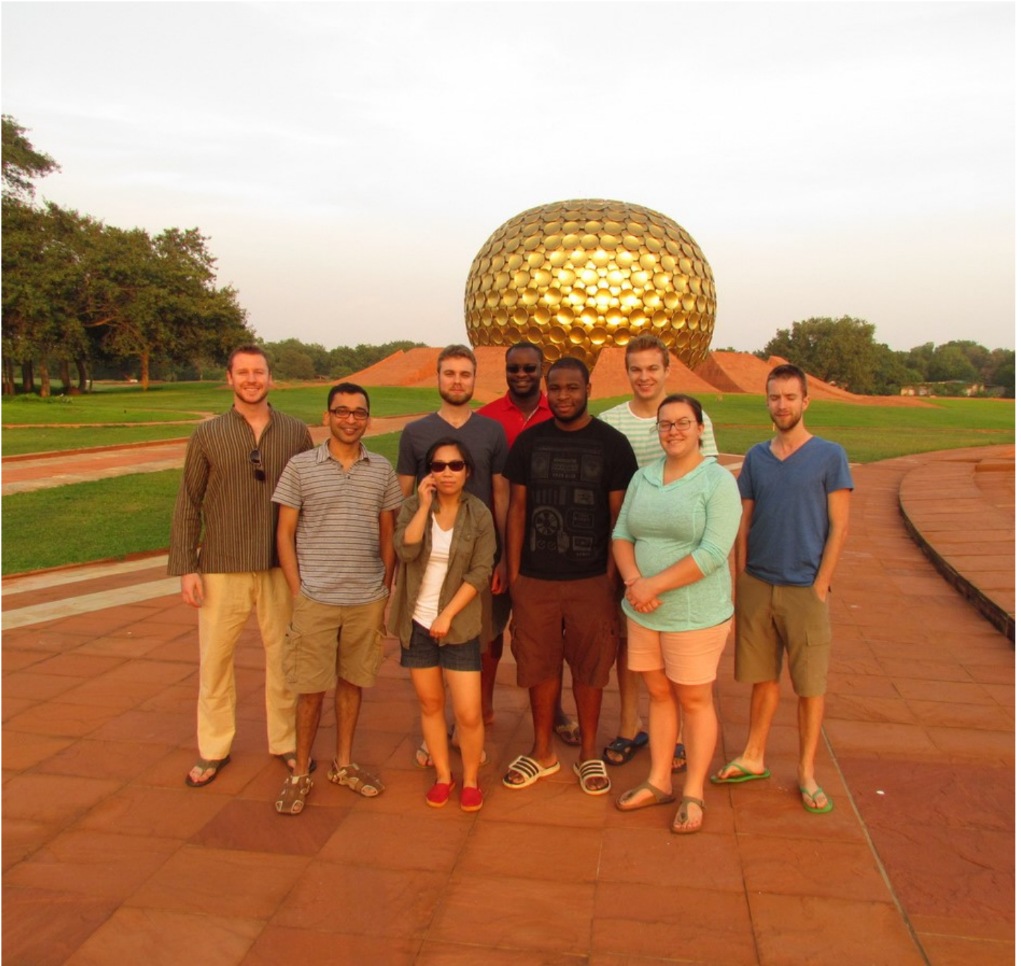
2013 International Project Course team in Auroville, India

School of Urban and Regional Planning | Kingston, Ontario | Number 32 | Fall 2014