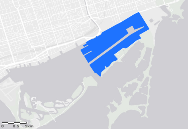
Figure Exec-1&2: Scale comparison, HafenCity, Hamburg (top) and Port Lands, Toronto (bottom).