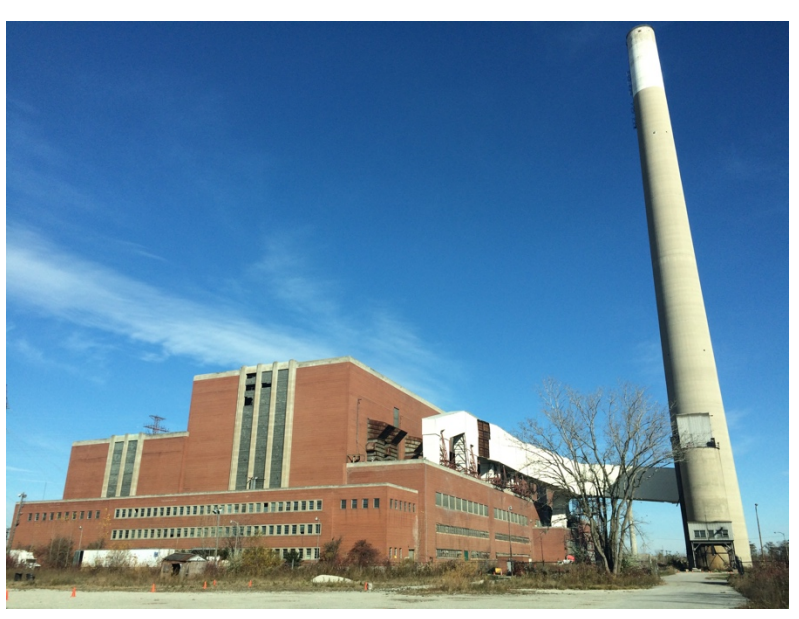
Figure Exec-4: The Hearn Generating Station, Port Lands, Toronto. Photo: Sjaarda, 2017.