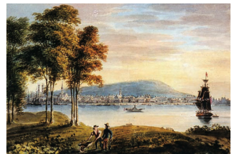
Montréal and Mont-Royal from St. Helen's Island, 1831

Montréal's view corridor protection policies were first adopted in the 1990 Master Development Plan for the Ville-Marie District , which included 12 views toward Mont-Royal from locations within the District. Today, there are 110 protected views: 23 from the Mountain to the St. Lawrence River and 87 from the city to the Mountain. The views were most recently amended in the 2004 Montréal Master Plan