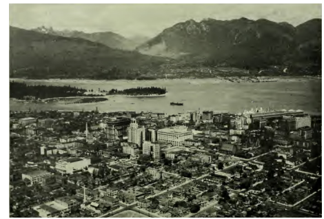
Vancouver's unique skyline as seen by Bartholomew in 1928

City Council adopted Vancouver's View Protection Guidelines in 1989 to preserve selected threatened views around the city. The Guidelines were most recently amended in 2011 and currently include 36 protected view cones and view cone sub-sections. Of these view cones, 24 fulfill the selection criteria and were observed for this report.