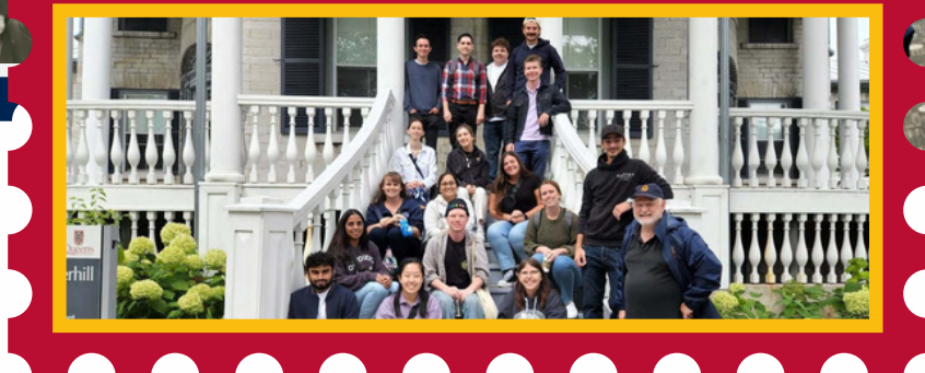
SURP classes of '74 (top) and '24