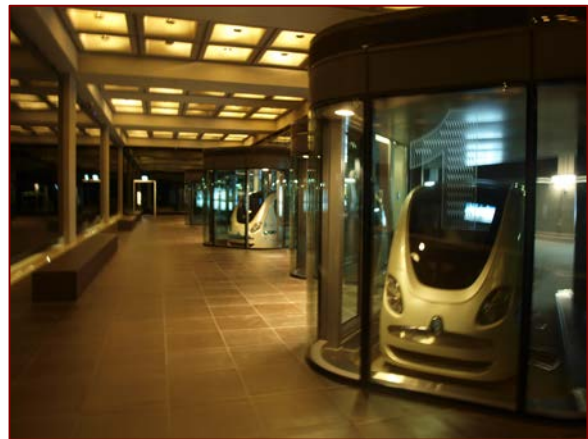
Masdar City PRT Station

The city utilizes a unique and innovative public transportation system to transport residents if there ever arises a need to travel to a far destination. A network of self-driven electric powered cars connects people from every corner of the city. This transportation mode known as Personal Rapid Transit (PRT) is designed such that every resident lives within a 5 minutes walking distance to public transport. The energy required to power the PRT comes from renewable sources—namely solar. Masdar City does not have a street network for private vehicles.