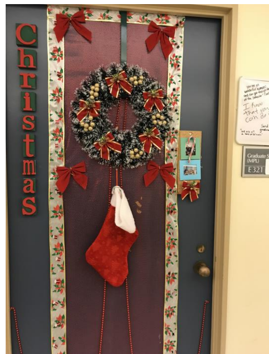
Overall Best Door – E321