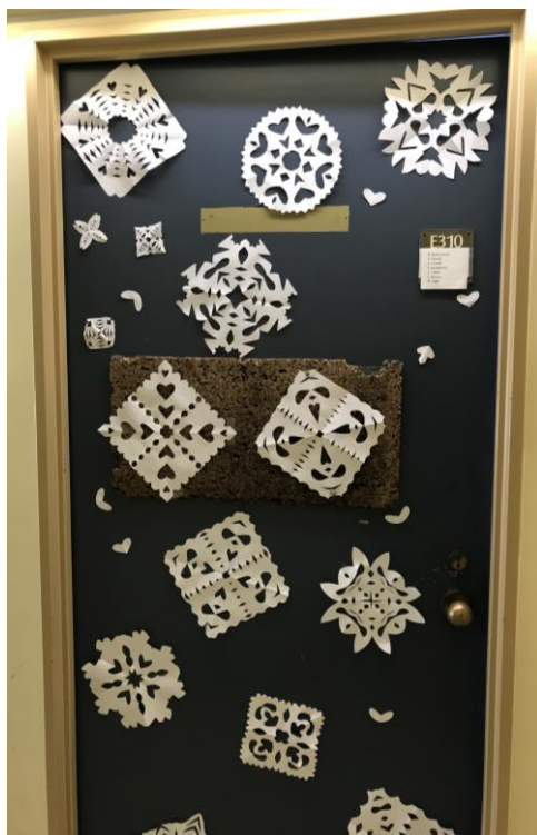
Most Geometric Snowflake – E310

Also, see the end of this newsletter for details on this year's Annual Winter Social!