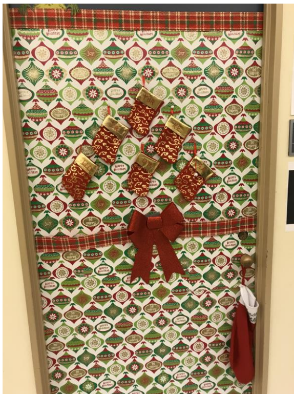
Honourable Mention – SURP