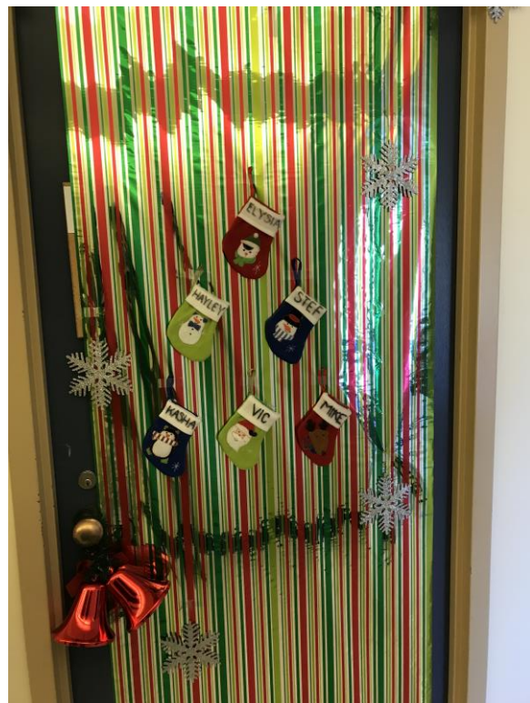
Honourable Mention - SURP