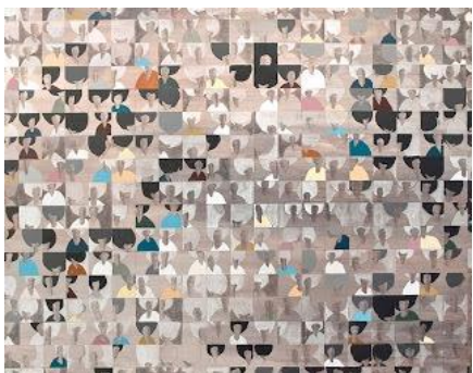
Sandra Brewster, Untitled (Smiths), mixed media on wood, 48x60in., 2011

Donations will support the development of the Black Studies program at Queen’s University.