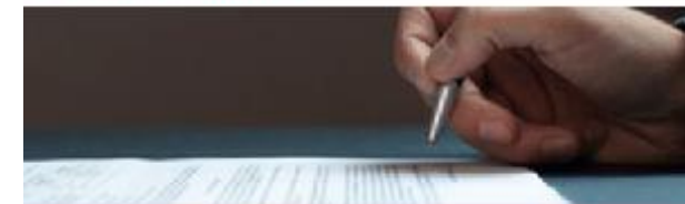
Cover Letter Module