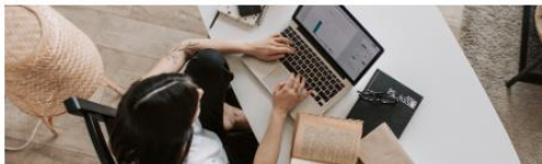
Career Exploration Module

The Career Prep Modules are a series of self-directed resources designed by the staff at Career Services to support you with your career goals. Whether you are looking to work on your resume or cover letter, prepare for an interview, or explore your career options, you will find resources to support you. Each module takes approximately 30-45min to complete.