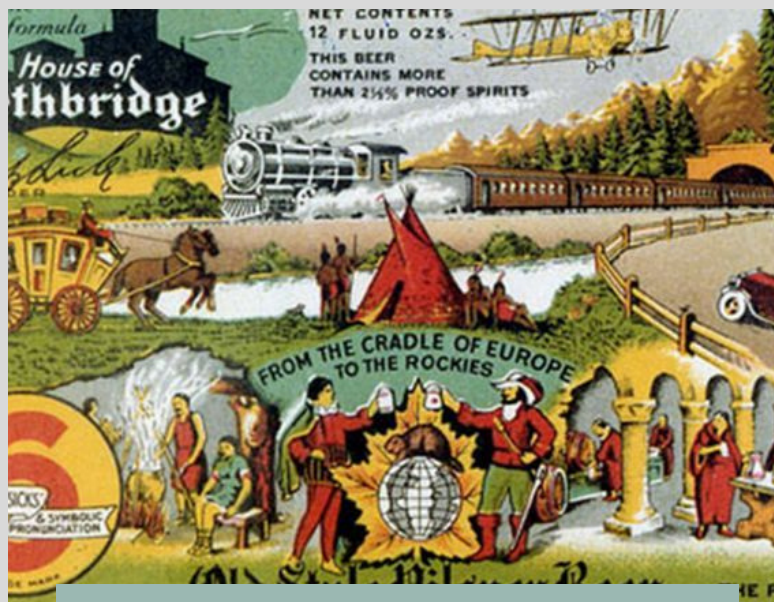
HIST 260 CANADA FROM THE CONQUEST TO THE PRESENT

Register now on SOLUS or email hist.undergrad@queensu.ca for assistance!