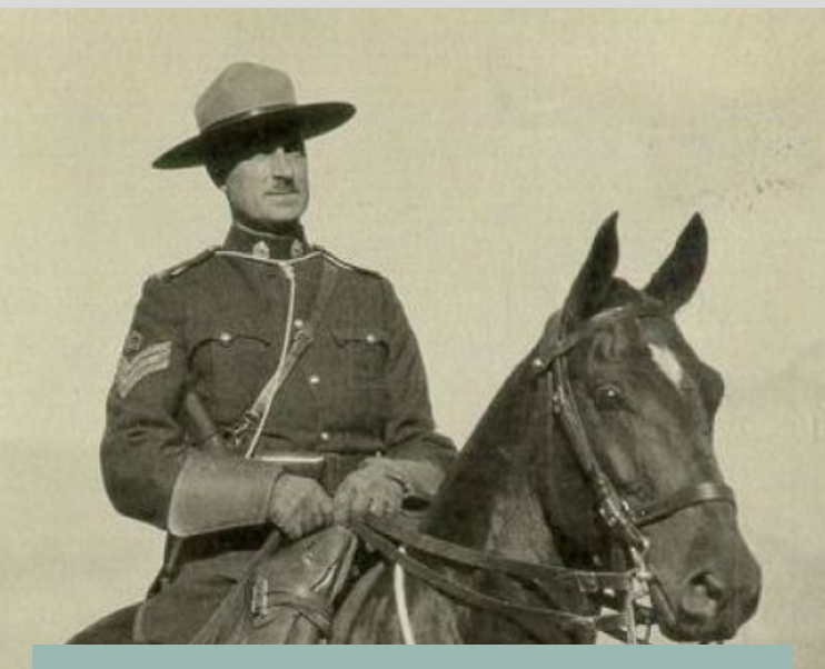
HIST 242 A CULTURAL-POLITICAL HISTORY OF SECURITY AND SURVEILLANCE