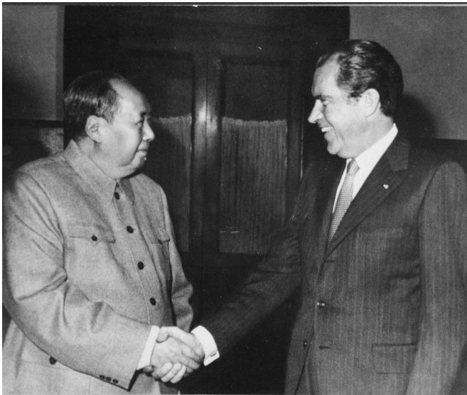
Above: China's paramount leader, Mao Zedong, meets with US President Richard Nixon, February 21, 1972.