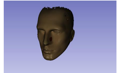
Figure 1: 3D Surface scan of mannequin head, with sticker on nose representing a skin lesion.