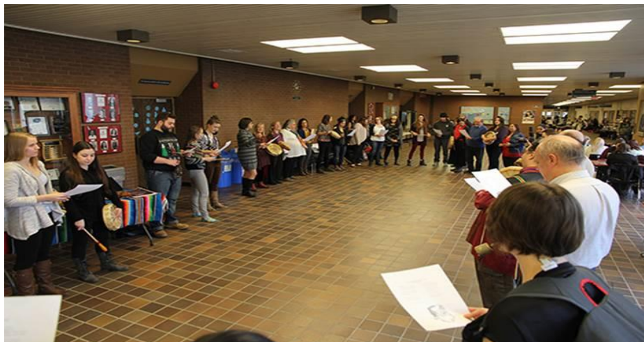
The Aboriginal Teacher Education Program in the Faculty of Education holds a campus community event to acknowledge the release of the final report of the Truth and Reconciliation Commission.