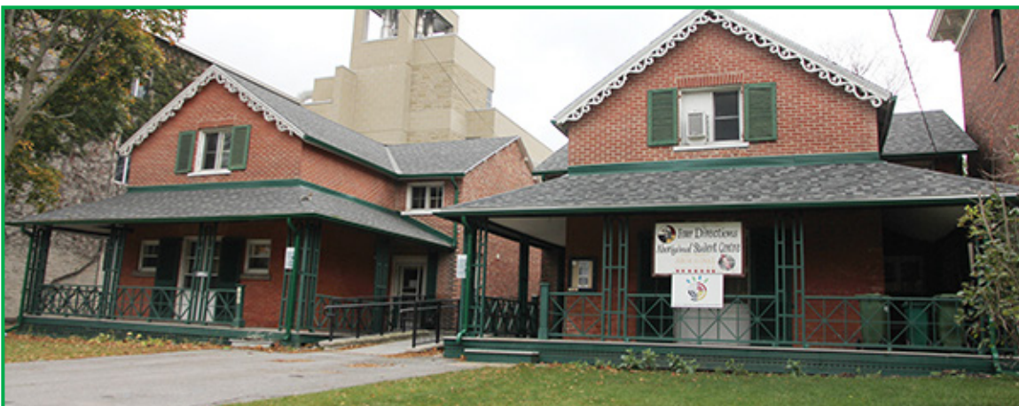
Four Directions Indigenous Student Centre