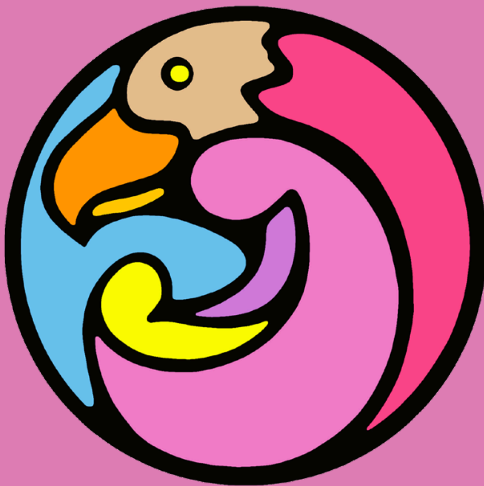
"Love" by Portia Chapman