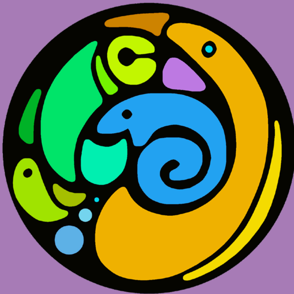
"Humility" by Portia Chapman