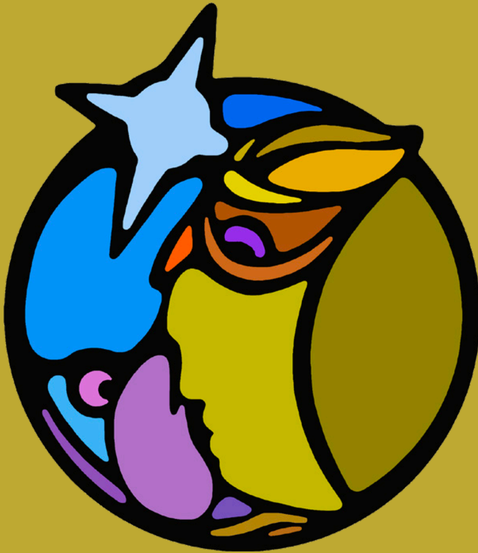
"Bravery" by Portia Chapman