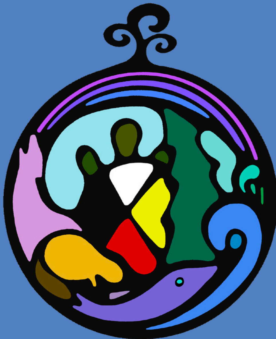
"Righteousness" by Portia Chapman