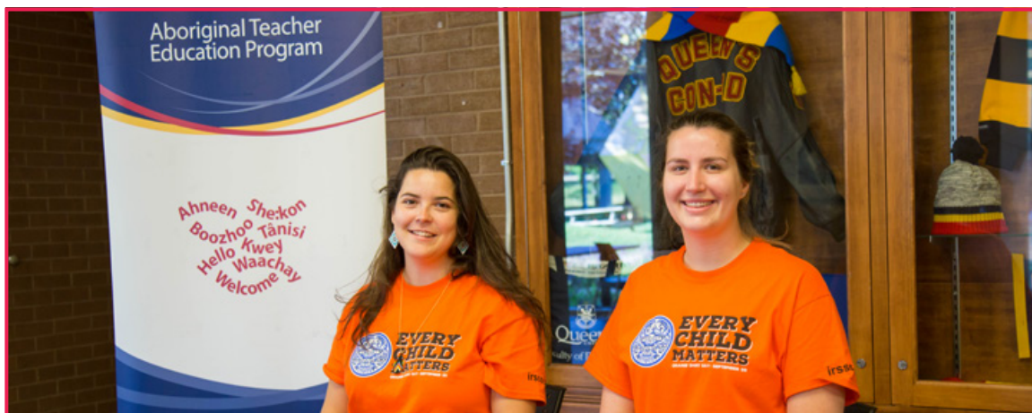
Orange Shirt Day, Faculty of Education