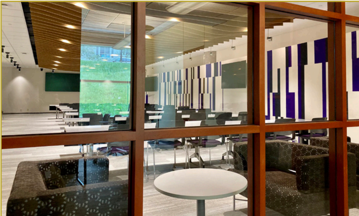
Indigenous-focused learning space in Stauffer Library

Lastly, plans are in progress to develop an Indigenous Hub and space for the Indigenous Advisor within the Faculty of Arts and Science.