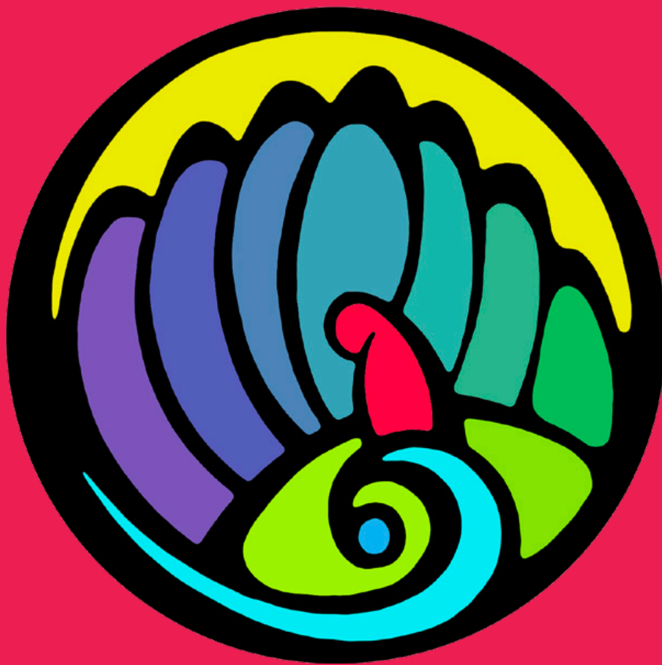
"Knowledge" by Portia Chapman