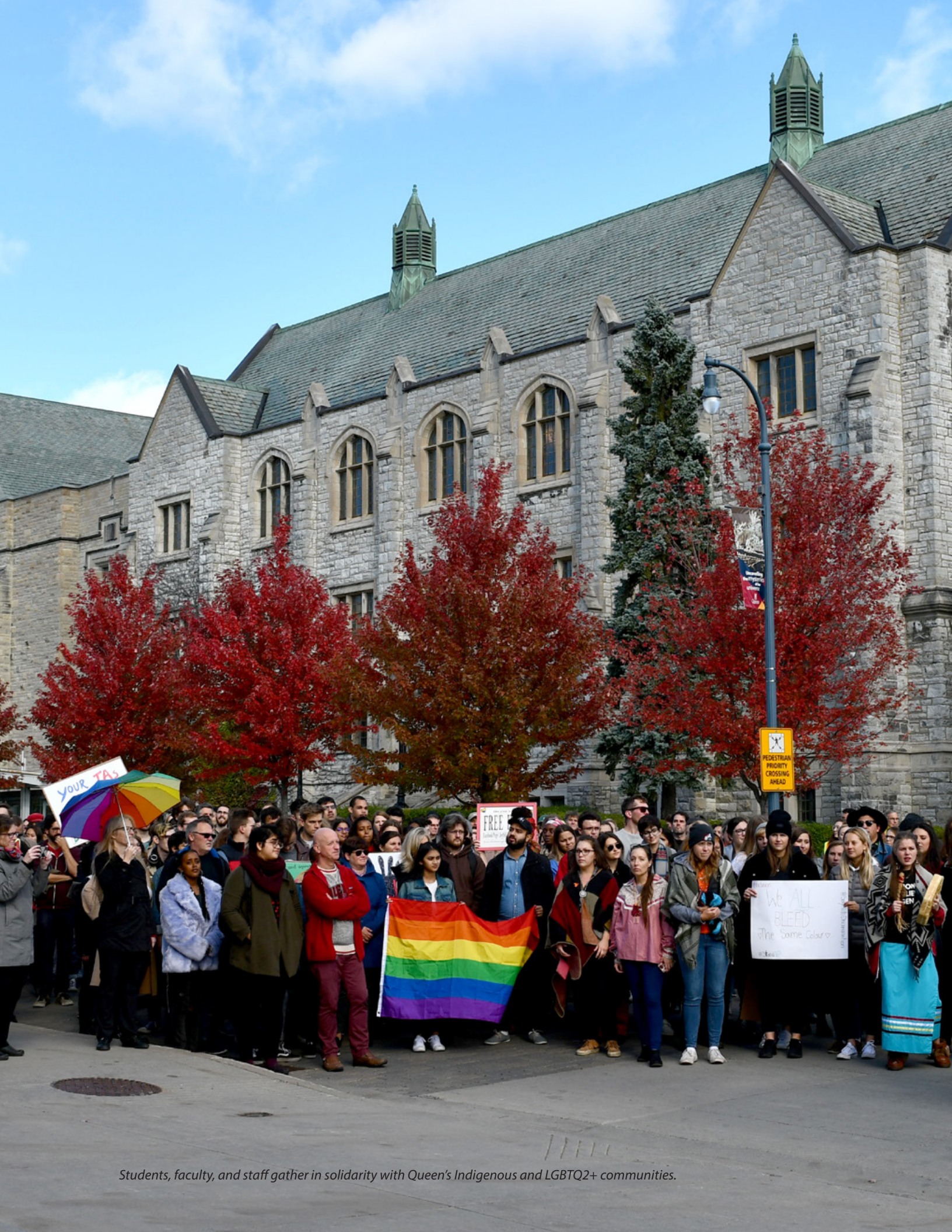
Students, faculty, and staff gather in solidarity with Queen's Indigenous and LGBTQ2+ communities.