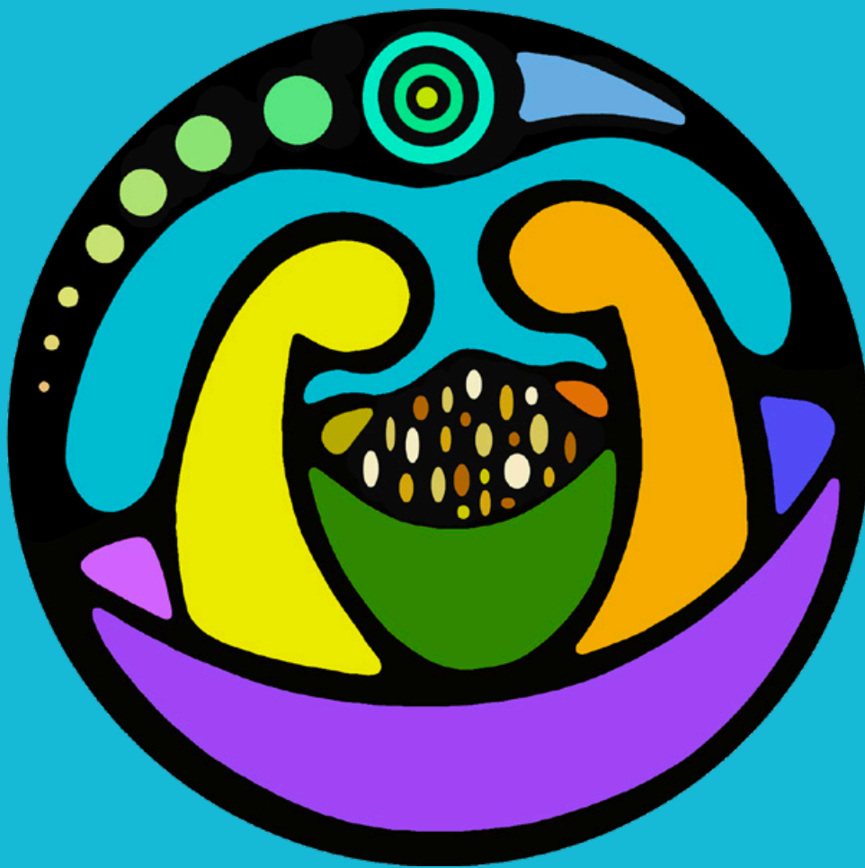
"Honour" by Portia Chapman