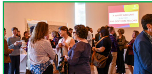
Indigenous Pre-Doctoral Reception, 2019