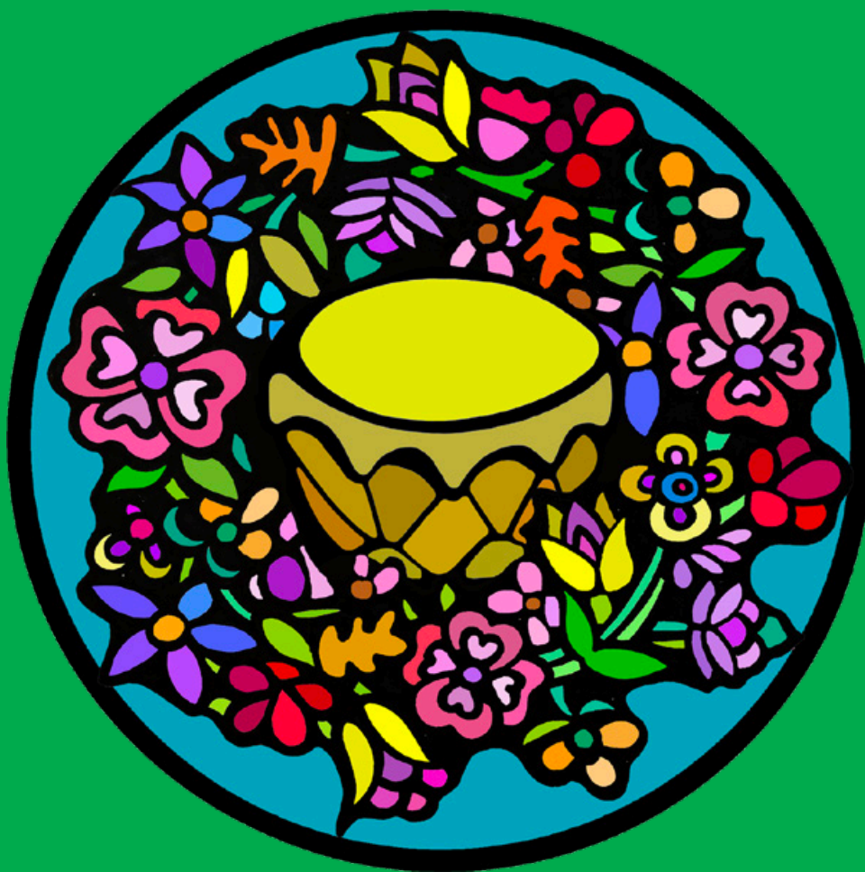
"Peace" by Portia Chapman