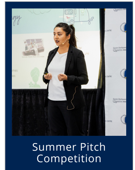
Summer Pitch Competition

Rose Event Commons 69 Union Street Kingston, ON