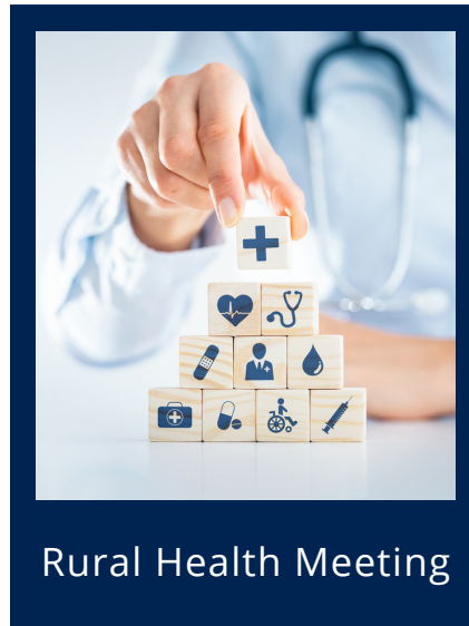
Rural Health Meeting

Rose Event Commons 69 Union Street Kingston, ON