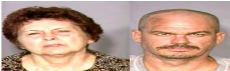
Las Vegas couple plotted to kidnap and kill police officers, A growing movement in the USA.