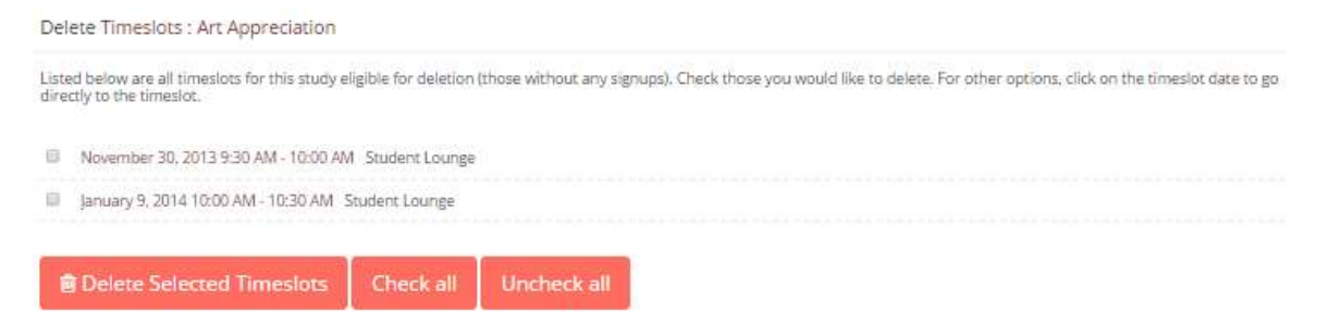
Figure 27 - Delete Multiple Timeslots

The system routinely deletes all empty timeslots more than 3 months old to preserve database space.