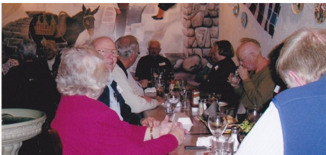
LUNCHEONS PAST at the Greek Isles October 2006