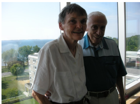
View from a Brant House Common Room