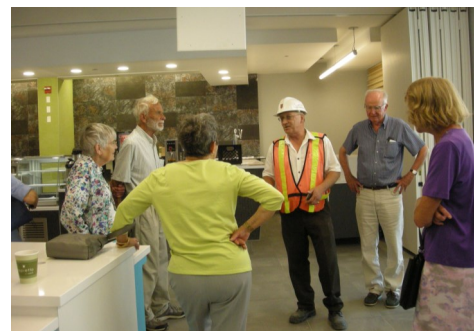
Location 21 in Smith House