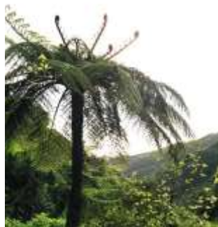
North Island, New Zealand