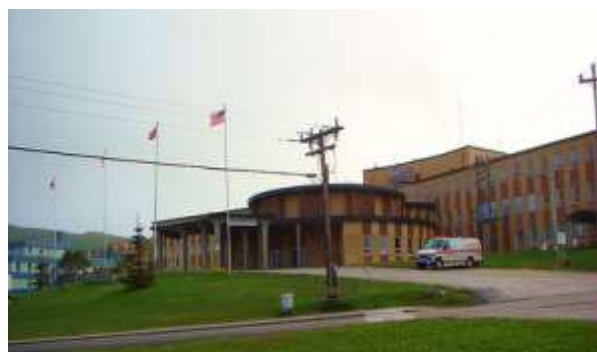
Curtis Memorial Hospital, St. Anthony, NL

Then, when my wife and I had become Canadians and started a family, I settled in for 6½ years as a physician in Placentia, NL. It was a chance encounter idly leafing through a medical journal in the 1980s that I came across an ad for an academic position in the Department of Family Medicine at Queen's University... and thus began 20 years in Kingston.