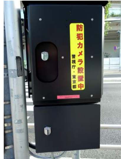
‘Security cameras in operation here”

The police officers and security guards are much in evidence but on this sunny morning months away from the Olympics itself, they seem relaxed. Two officers laugh and joke at a pedestrian crossing before they eventually return to patrolling. I get shouted at with a loudhailer from a passing police van, but only because I crossed the road at a non-designated place, despite the fact that there was nothing coming in either direction.