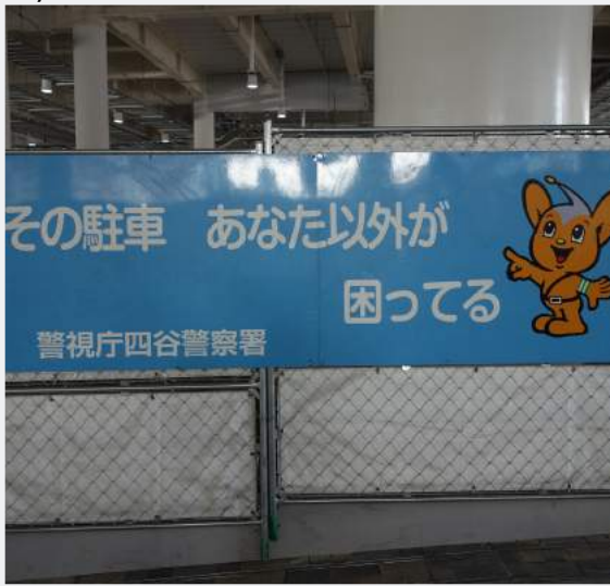
‘Pipo-kun says: “Please don’t park your bike here because it might cause inconvenience to someone else”’