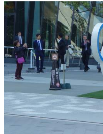
"People take pictures of each other"

When I get back on the train at Setagaya, the next station down from Shinanomachi, having done two circuits of the stadium, it's clear that the train and metro stations are all being upgraded, probably as much for crowd-flow reasons as security. Japan Railways' Group Security division is also on my contact list. I wonder whether I've given them enough time to respond and whether I should contact them again... either way, I'll need to come back down here and get some pictures inside the stations. I'll almost certainly get asked to leave eventually, but I will try to be as subtle as possible.