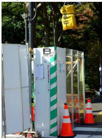
"The mess of security in practice"