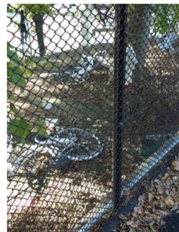
"People lived here"