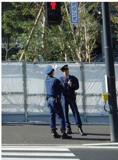
"Officers enjoying a chat"

The police officers and security guards are much in evidence but on this sunny morning months away from the Olympics itself, they seem relaxed. Two officers laugh and joke at a pedestrian crossing before they eventually return to patrolling. I get shouted at with a loudhailer from a passing police van, but only because I crossed the road at a non-designated place, despite the fact that there was nothing coming in either direction.